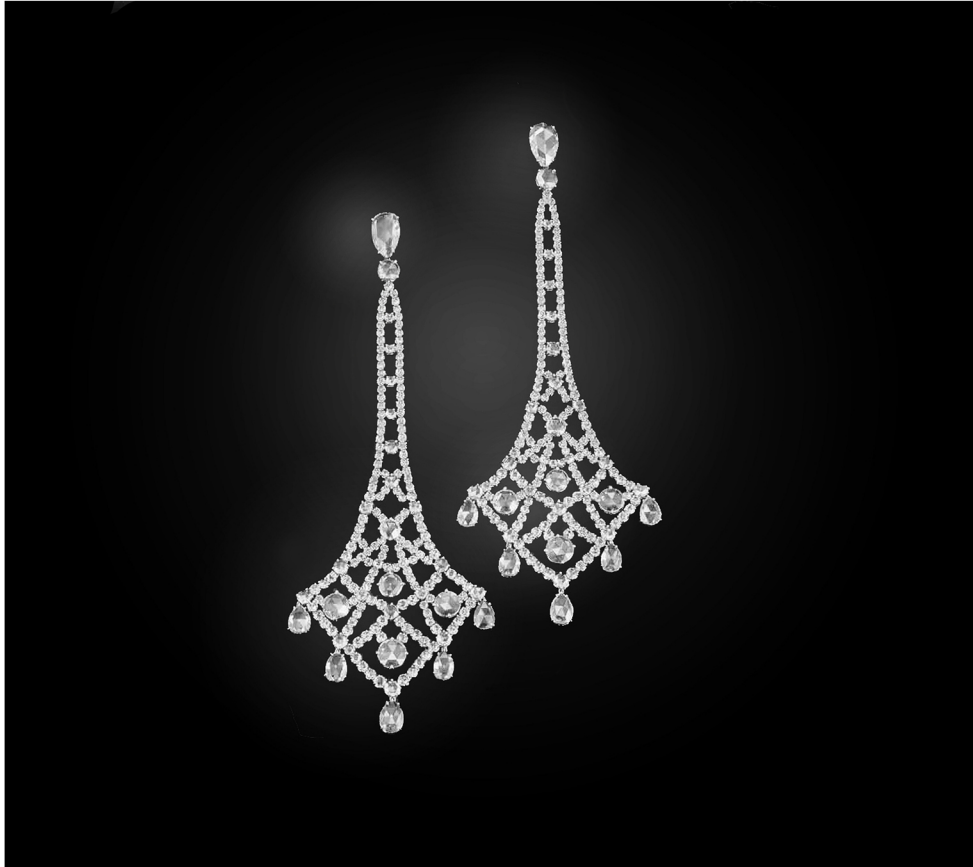
131 'Eiffel Tower' platinum, diamond, L 125, W 45 Michelle Ong for Carnet, 2002 368 white rose-cut diamonds with a total weight of 18.99 carats mounted in platinum. Carnet